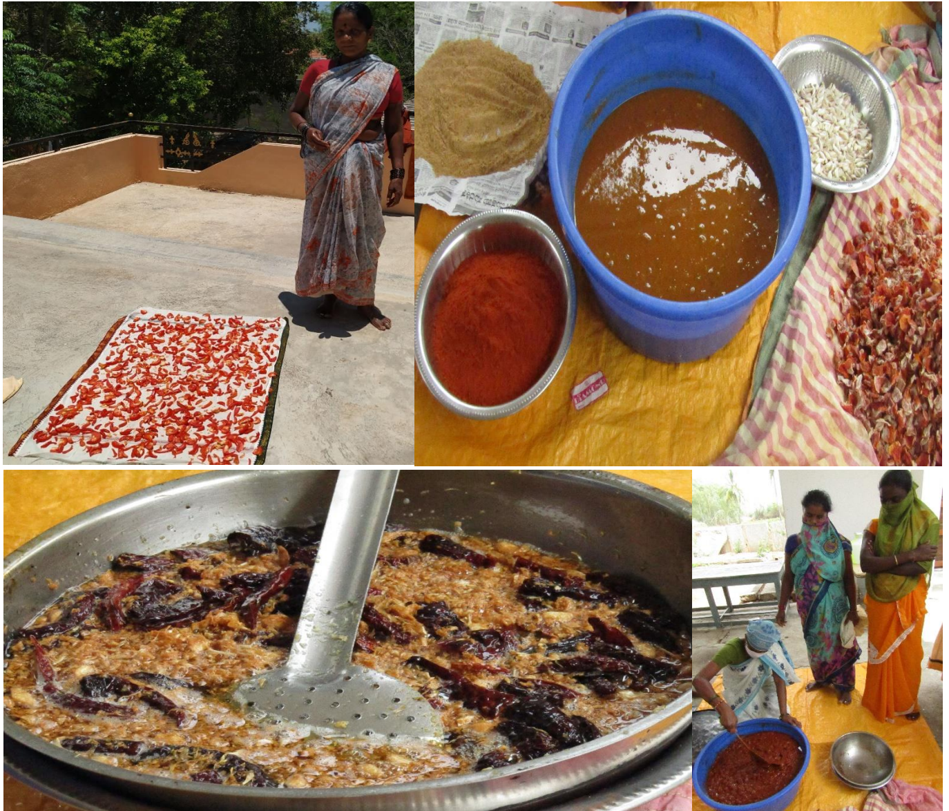
d. These 14 girls influenced 40 families in the village to process TOMATOS into TOMATO FLAKES