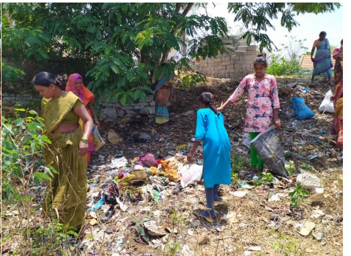
CLEANING VILAGE LAKE, COLLECTING PLASTICS FROM THE VILLAGE LAKE TO TRANSPORT TO RECYCLE UNIT

For all the above dollar rupee exchange rate was taken @ 1US$ = 76.4825 AS ON 15 TH APRIL 2020.