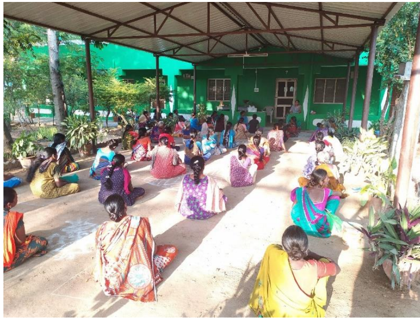
WOMEN FROM DODDIGANA HALLI ASSEMBLED TO COLLECT FOOD