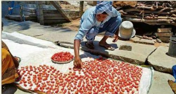
A farmer dries up tomatoes to make tomato flakes in Mulbagal, Kolar district.