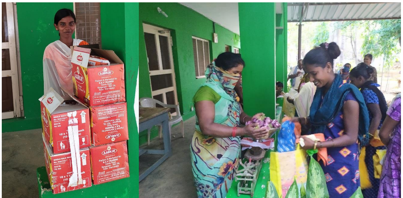
COLLECTING ONIONS & VEGETABLES

Till date Grama Vikas has utilized Rs.2,07,302/- (about US$ 2,710). Source of this expenditure was Grama Vikas own Funds and donations raised from Board members of the organization, friends, staff of the organization, and well-wishers of Grama Vikas to the tune of Rs.2,07,302/- (US$ 2,710).