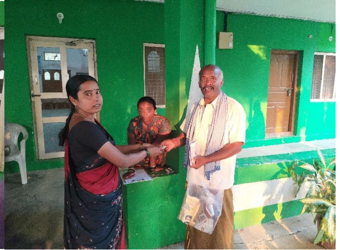
COLLECTING MEDICINES FOR DIABETES