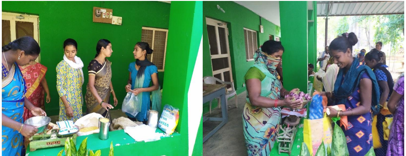
YOUNG WOMEN BRIGADE GETTING READY TO DISTRIBUTE FOOD ITEMS

We are in the process of raising US$ 28.763 to meet one-month food and vegetables for 1000 families who come under Devarayasamudra Grama Panchayat (local government) jurisdiction which covers 17 villages.