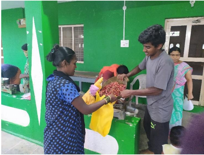
COLLECTING RED CHILLIES (SPICES)

So far, we have supplied the following to 114 families in Devarayasamudra Grama Panchayat villages.