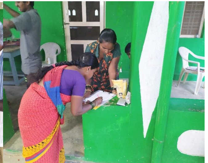
SIGNING THE DOCUMENT