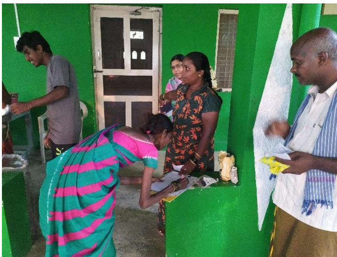
AFFIXING SIGNATURE BEFORE COLLECTING MEDICINES

Potato Ladies fingers (Bhendi) Ridge gourd Raddish